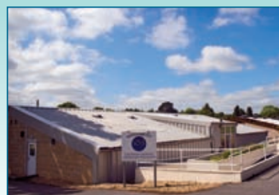
Southern Counties Veterinary Specialists (SCVS) - Ringwood / Hampshire