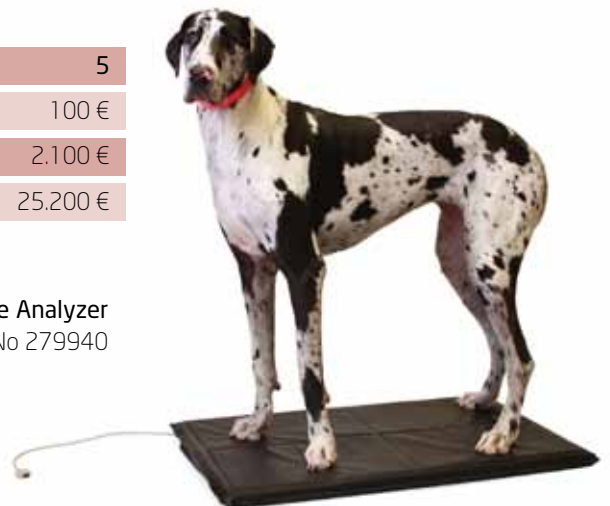
Stance Analyzer Cat. No 279940